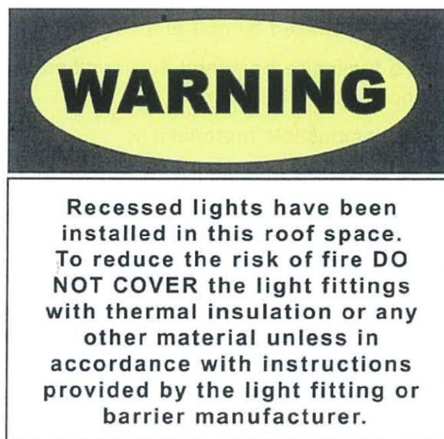
FIGURE 4.8 WARNING SIGN TO BE INSTALLED IN ACCESSIBLE ROOF SPACES CONTAINING RECESSED LUMINAIRES

Where recessed luminaires are installed in an accessible roof space, a permanent and legible warning sign shall be installed in the roof space adjacent to the access panel, in a position that is visible to a person entering the space. The sign shall comply with AS 1319 and contain the words shown in Figure 4.8 with a minimum size of lettering of 10 mm.